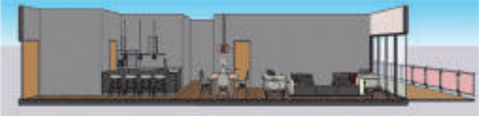
Corte - Cocina, Comedor, Sala