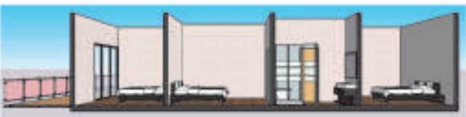
Corte - Recamaras